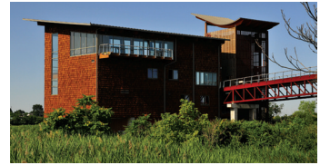
DuPont Environmental Education Center (DEEC)