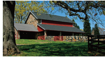
Coverdale Farm Preserve