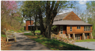
Ashland Nature Center