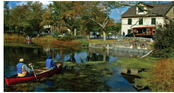
Abbott's Mill Nature Center